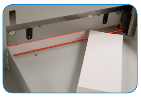
Crisp, accurate cuts Hardened steel blade for razor sharp cuts